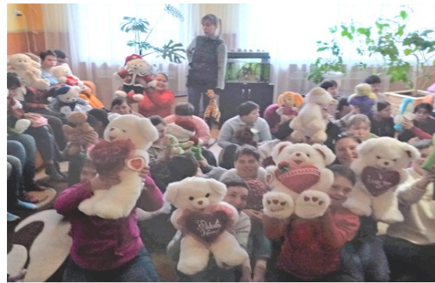
Stuffed animals for girls at a developmentally disabled orphanage.