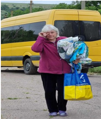
Elderly women with tears in her eyes after receiving a quilt made by an LWML member