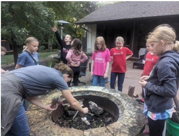
Explorers at the Fire Safety badge workshop.