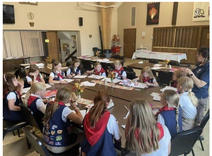
Our first meeting on September 11.