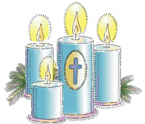
Pastoral Prayer for a New Year