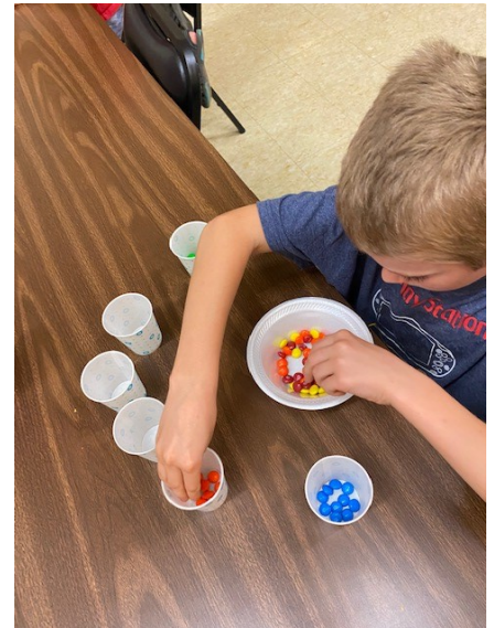
M&M sorting competition.

Rolling Whoppers hand-off Relay (teams on scooters while trying to keep a whoopper candy from rolling off their spoon before handing off to teammate)