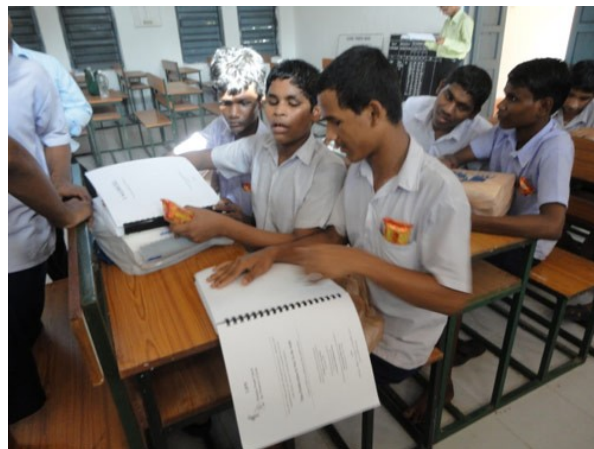
A number of young men at a school in India who are excited to be reading their volumes of a Braille Bible.

Lutheran Braille Workers (LBW) has been bringing the gospel to blind and visually impaired people around the world since 1943. In its 76 year history, LBW has produced and distributed for free over 14 million volumes of braille, large print, and audio materials. Many volunteers help produce these Bibles and other materials using zinc plates, braille presses, specialized paper, covers, and spiral bindings. Currently these materials are published in 11 languages and sent to over 130 countries. They have published over 220,000 volumes over the last 42 months as the demand keeps increasing. This incredible volume takes its toll on the production equipment since each page requires separate zinc plates which are produced by a plate embossing device. The main challenge facing LBW's goal is having the machines and technology available to produce the zinc plates. With this grant LBW will be able to purchase a PUMA plate embossing device capable of creating the necessary number of zinc plates to meet production needs. It will also allow the production of more plates in different languages, reaching even more people with the Good News of Salvation.