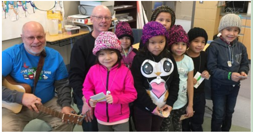
Shamattwa winter visit using How to Pray booklet

LAMP Ministry Inc. has ministered for nearly 50 years in northern Canada where many villages are reachable only by aircraft or seasonal roads. Currently, nearly one million Indigenous people live in these isolated areas with about half of them under the age of 14. The most alarming statistic is that over 15 percent of children and youth will actually take their own lives out of despair and hopelessness. When LAMP goes into these communities with VBS, Bible studies, and personal witnessing, these communities will have access to Christian education for faith in Christ. In order to fulfill their mission of sharing the gospel in the next few years, LAMP will need to expand their staff of full-time missionary pilots to four or five. LAMP will need to recruit and train 100 to 200 more volunteer missionaries committed to serve at least five years. This grant will provide the funds to help LAMP reach their goal.