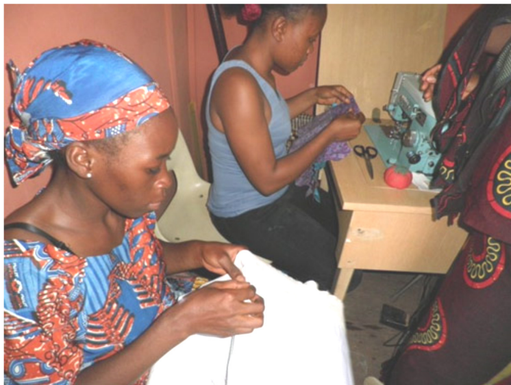
Girls and young women, helped through Lutheran Hour Ministries—Cameroon, are taught a simple vocation like sewing and cloth-making, and learn about God's saving Word.

Through its ministry centers, Lutheran Hour Ministries is offering programs that are a powerful force to physically and spiritually change the lives of young women to disrupt the cycle of poverty and prostitution by teaching income producing trades for economic independence and success, sharing the Gospel, and connecting them with the church. The purpose of this grant is to identify young women in prisons after they have been arrested for prostitution or small crimes and provide rehabilitation through counseling sessions and voluntary Bible studies for those young women expressing a desire to reform and connecting them with the church.