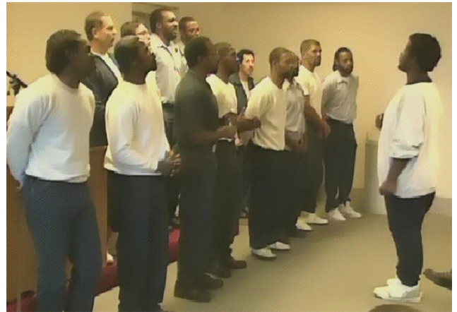
This is an Inmate Choir singing at a Divine Service being conducted by one of our LCMS Pastors.

One of the largest needs in Prison and Jail Ministry is not only the offering of Word and Sacrament ministry to those incarcerated, but also in assisting the person when he or she returns to the community. The Prison and Jail Ministry Conference enables over 200 lay and clergy participants from 30 of our LCMS districts to learn about the importance of prison and jail ministry as well as networking with one another for best practices and support of each other in a very difficult mission and ministry. A number of LCMS districts are already doing, or are starting up a Prison and Jail Ministry, and a Synod-wide conference will allow these to continue and expand as changes and new developments continue in the federal and state criminal justice systems. Grant funds would help pay for the expenses involved in hosting a conference.