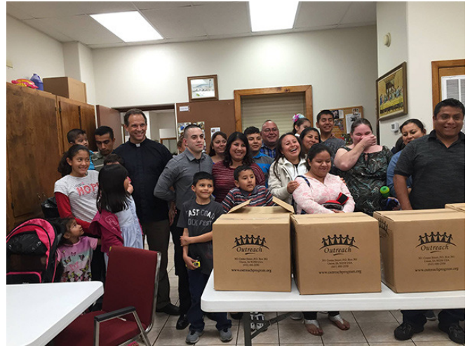
Free rice meals for the families.

The congregations of Texas District Circuit 28 have a great desire to work together as one group in training mission workers to share the Word and unite these congregations and communities. The Rio Grande Valley of Texas shares the border with Mexico and has a large Hispanic population, many of whom are among the poorest of poor, at risk and unchurched. They have developed a long-range plan to assist the struggling congregations in reaching out to the communities to bring the Word into the homes of hurting families. The first step in the plan has been realized with the arrival of a Director of Christian Education (DCE) that will be serving the circuit – not just an individual church. With this in place, the next stages can begin by training leaders within the congregations in a mission and ministry model utilized by a local, thriving congregation, building campus relationships with the 50,000 students attending local colleges, and conducting community mercy projects. These funds will assist in the project startup costs, training materials, transportation costs, scholarships, and other incurred expenses of the training program.