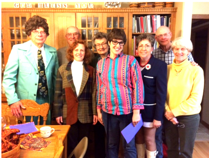
The winning team of the "70's Trivia" challenge