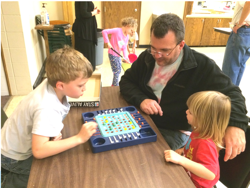
Photos from May 11 LYF event.