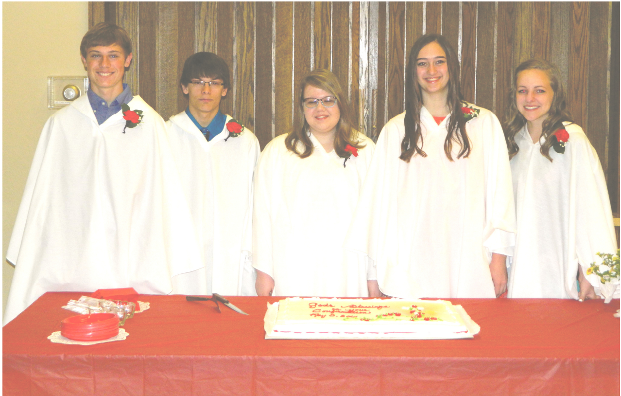
The Board of Education congratulates our confirmands on their confirmation on May 3 rd .

The Board of Education is always looking for more members—we are doing some exciting things!