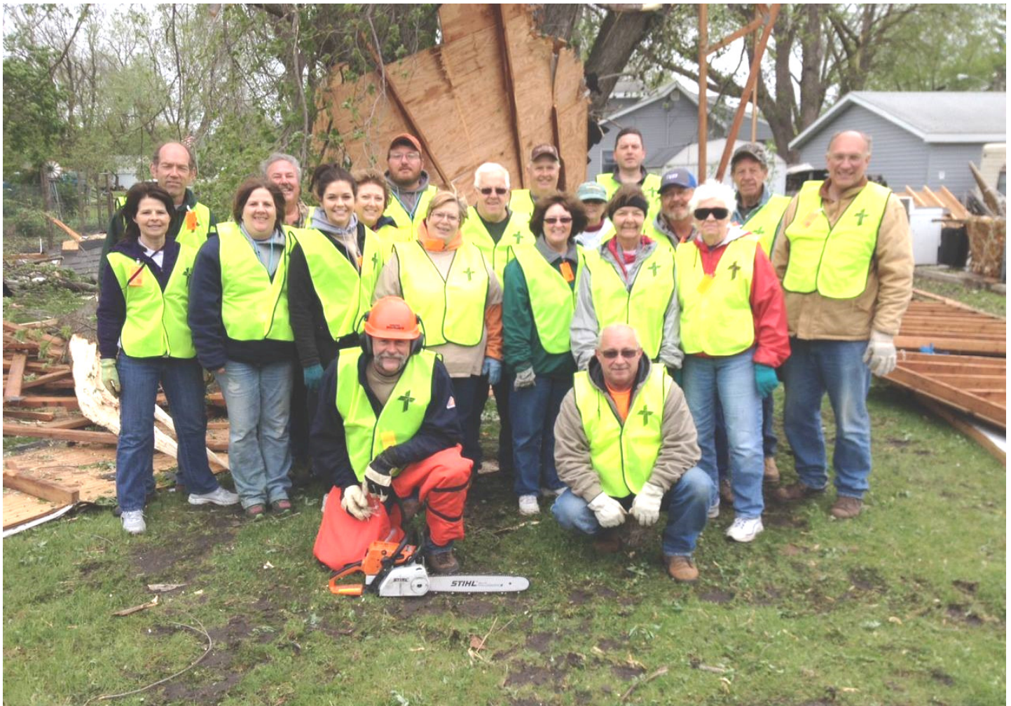
LERT (Lutheran Emergency Response Team) workers from Boone and Sac Circuits who helped at Lake City after the tornado.